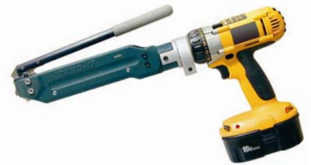
UL4000 Ultra-Lok® Rechargeable Portable Tool