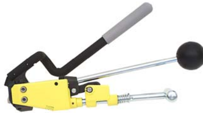
UL-T300 Ultra-Lok® Manual Tool