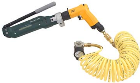
UL-X69001 Ultra-Lok® Pneumatic Tool