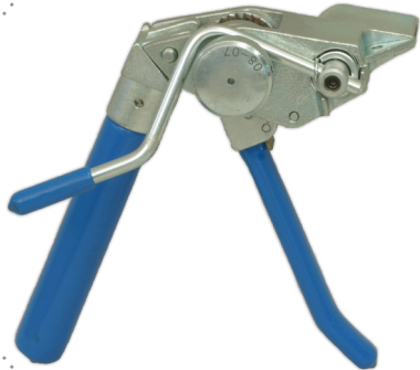
C07569 Bantam Tool

The C07569 Bantam tool is ideal for sign hanging, pole attachment, and other light to medium duty clamping applications in the field