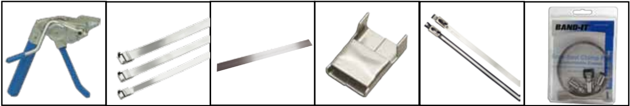
C07569 Bantam Tool BAND-FAST® with Clip 1/2" Value Strap 1/2" Value Clip Ball-Lok Ties Scru-Seal Clamps