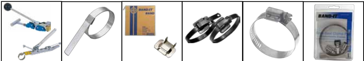
T30069 Center Punch Tool & S03869 Center Punch Tool Center Punch Preformed Clamps BAND-IT® Band & Ear-Lokt Buckle BAND-IT® Ties Worm Gear Clamps Scru-Seal Clamps

For more detailed product information, please visit our website or call your sales associate today!