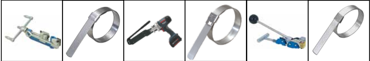
C00269 Junior® Hand Tool Junior® Smooth ID Preformed Clamps UL4000-B ULTRA-LOK® Tool ULTRA-LOK® Preformed Clamps T30069 Center Punch Tool Center Punch Preformed Clamps