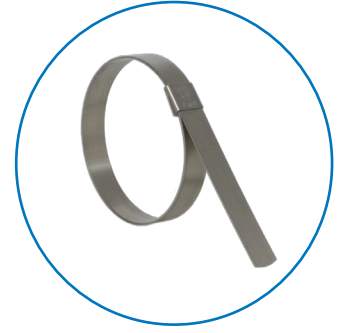
CENTER PUNCH CLAMPS

To ensure the performance of lifesaving safety sleeving, it must be securely fastened in place. BAND-IT ties & preformed clamps ensure permanent attachment, with a low profile buckle design.