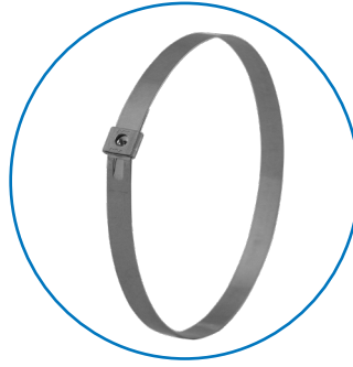
TIE-LOK® PREFORMED TIES