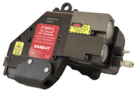
IT SERIES TOOLS COMPATIBLE WITH JR SMOOTH & TIE-LOK