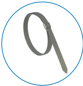
JUNIOR SMOOTH ID CLAMPS