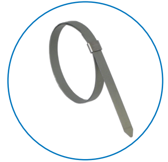
JUNIOR SMOOTH ID CLAMPS