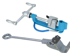
C00169 with J00169 Adaptor COMPATIBLE WITH JR SMOOTH