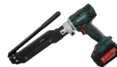
UL4000-D COMPATIBLE WITH ULTRA-LOK SYSTEMS