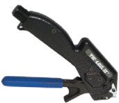
A920 TIE-LOK TOOL COMPATIBLE WITH TIE-LOK